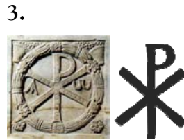
Chi-rho xristos Constantine (A.D. 312)/labarum In hoc signo vinces ("In this sign you shall conquer.")