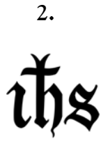
Iota-eta-sigma Ιησοῦς Jesus Hominem Salvator