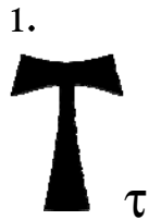
Tau St. Francis